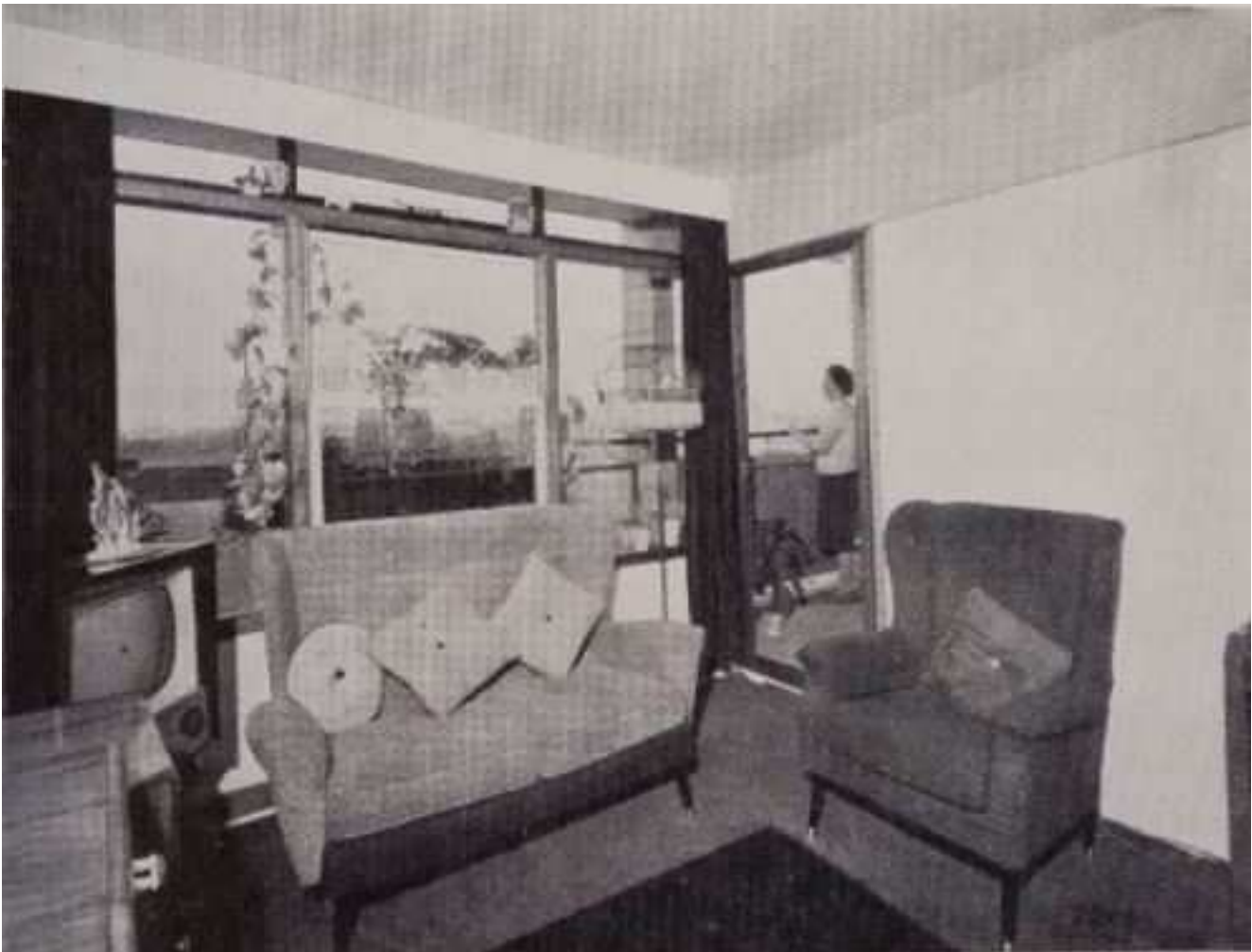
Living room of tower block flat

The six point blocks contained 64 two-bedroom flats with all the modern conveniences to be expected in public housing – a bathroom and separate toilet, an electric drying cupboard, a linen cupboard and broom cupboard plus warm air central heating (from a central boiler room) and constant hot water. Each flat also benefited from a full-length private balcony at its front and a second, smaller, balcony in front of the kitchen windows.