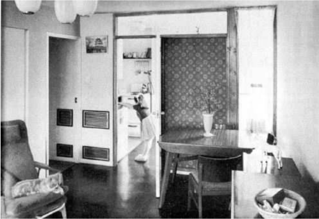
This image of the kitchen-diner also shows the Weatherfoil hot air heating system

At the top of each of the point blocks were four bed-sitter penthouses with private patios. The Housing Manager, moral antennae twitching, insisted that these be let to either all men or all women in any one block. One observer described these as ‘the only genuine metropolitan penthouses’ she knew ‘to be had for £4 a week with heating thrown in’.