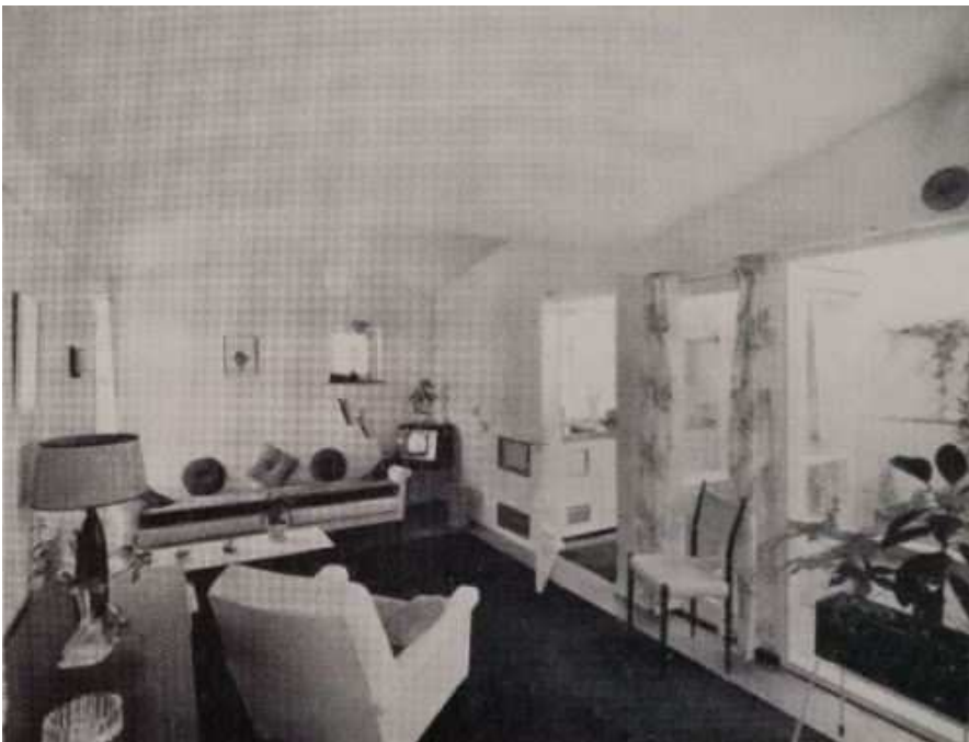
Living room of penthouse flat

At the top of each of the point blocks were four bed-sitter penthouses with private patios. The Housing Manager, moral antennae twitching, insisted that these be let to either all men or all women in any one block. One observer described these as ‘the only genuine metropolitan penthouses’ she knew ‘to be had for £4 a week with heating thrown in’.