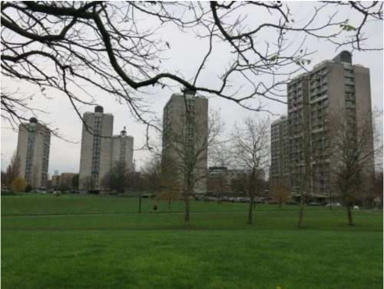
Signature six 18-storey point blocks

These towers are not some alien and overpowering presence in the terrain but fit, as the architects intended, comfortably into their landscape. Their mix of bush hammered (providing texture) and precast finishes, with patterns of strong horizontals and tripartite vertical pattern, along with a range of solid and glazed balconies, gave, it was said, ‘a more humane scale and greater architectural sophistication than earlier points’.