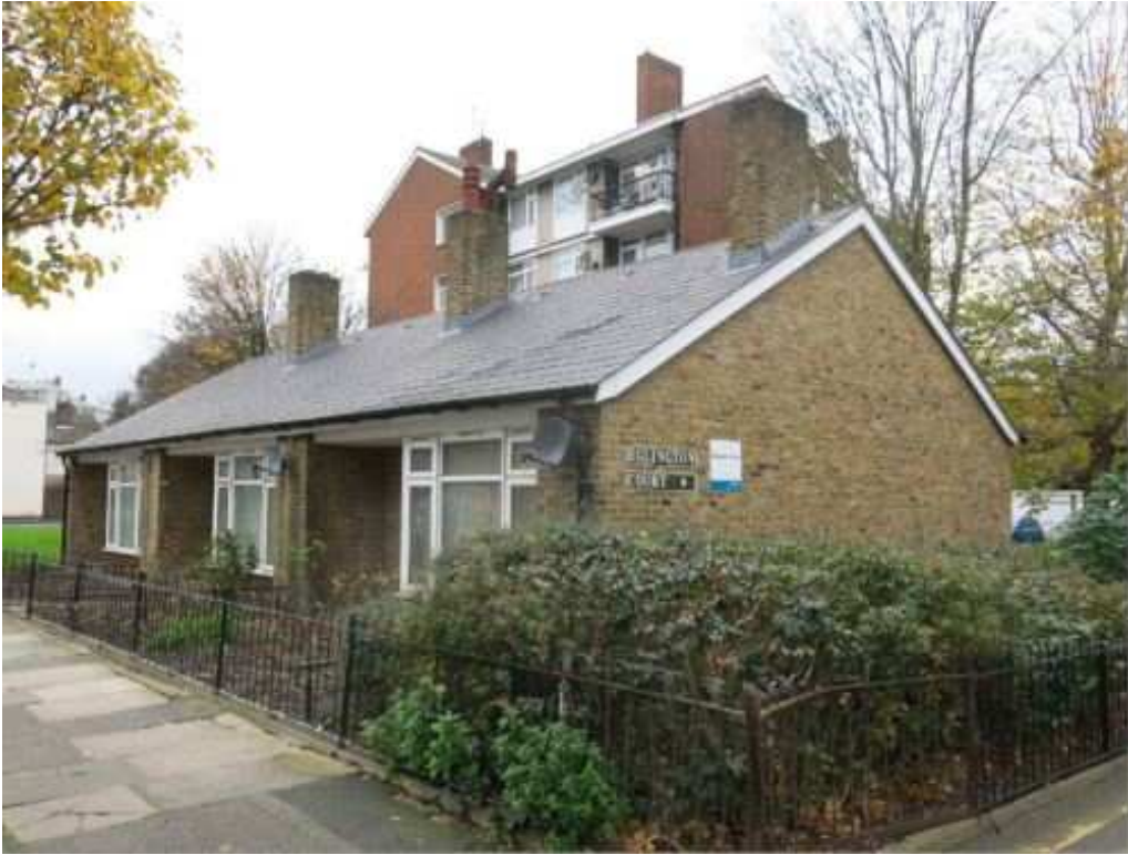
Bungalows for older people on Lorrimore Road