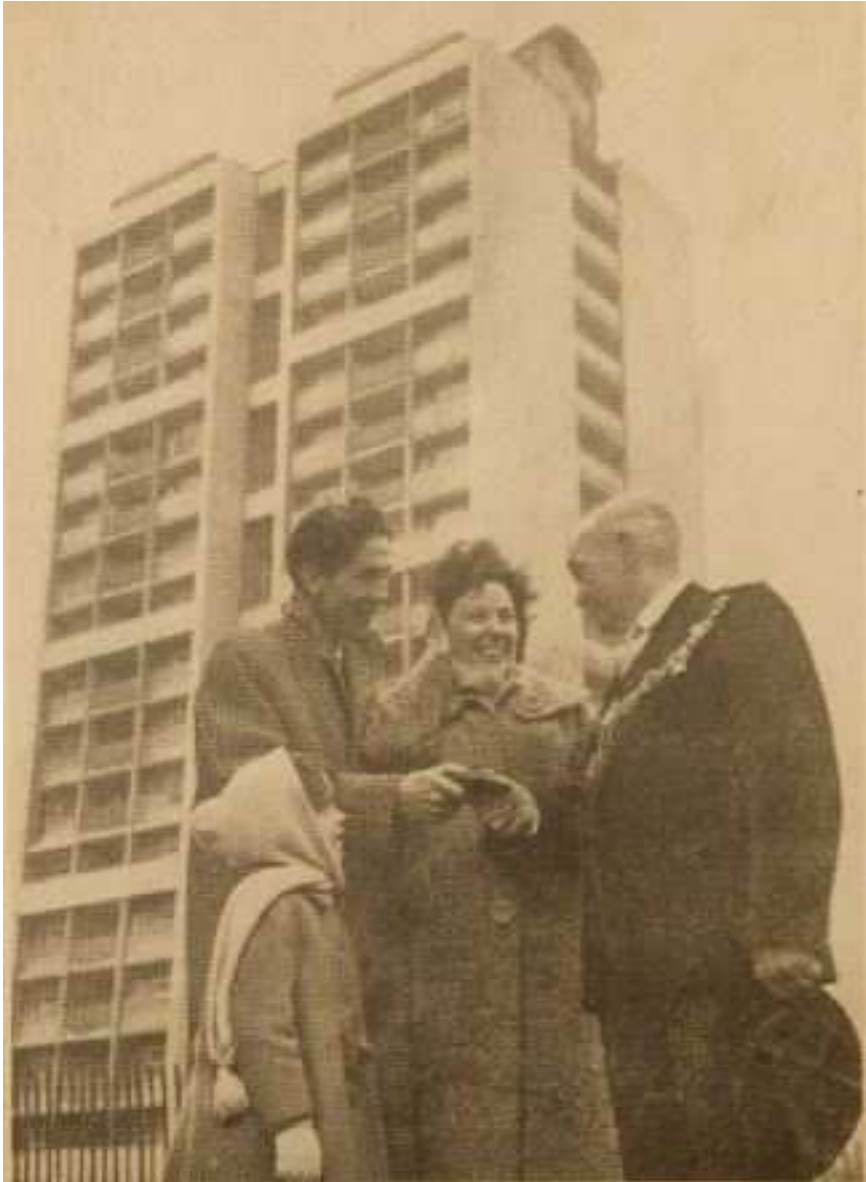
The first residents receive their keys from the mayor of Southwark in front of Cornish House