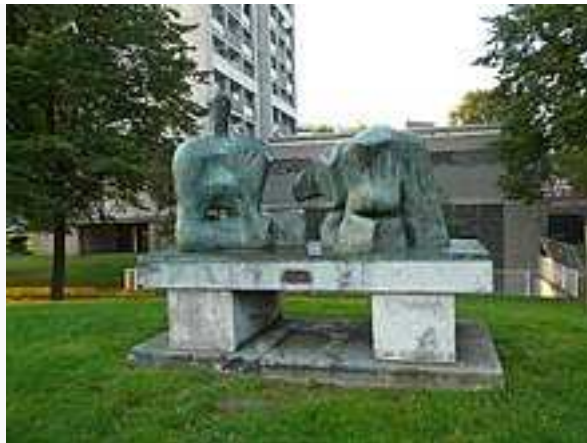
Reclining Figure No. 3 by Henry Moore