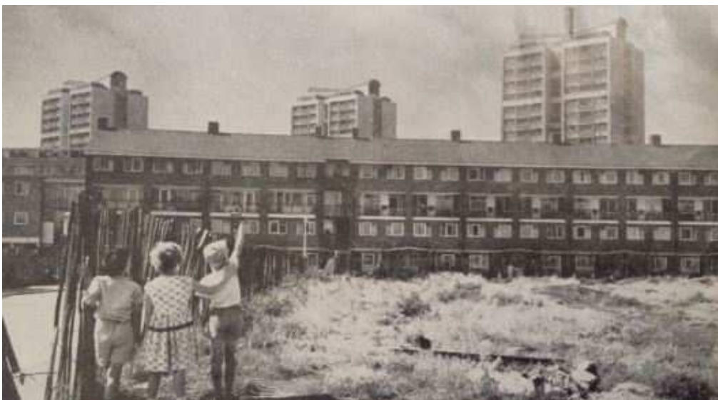
Pointing to the future, an early image of the Estate from Lorrimore Square

The visual presence of the Brandon Estate, in Southwark, with its path-breaking high-rise, and pioneering mixed development is distinguished as is 'one of the most novel' of the London County Council's housing schemes.