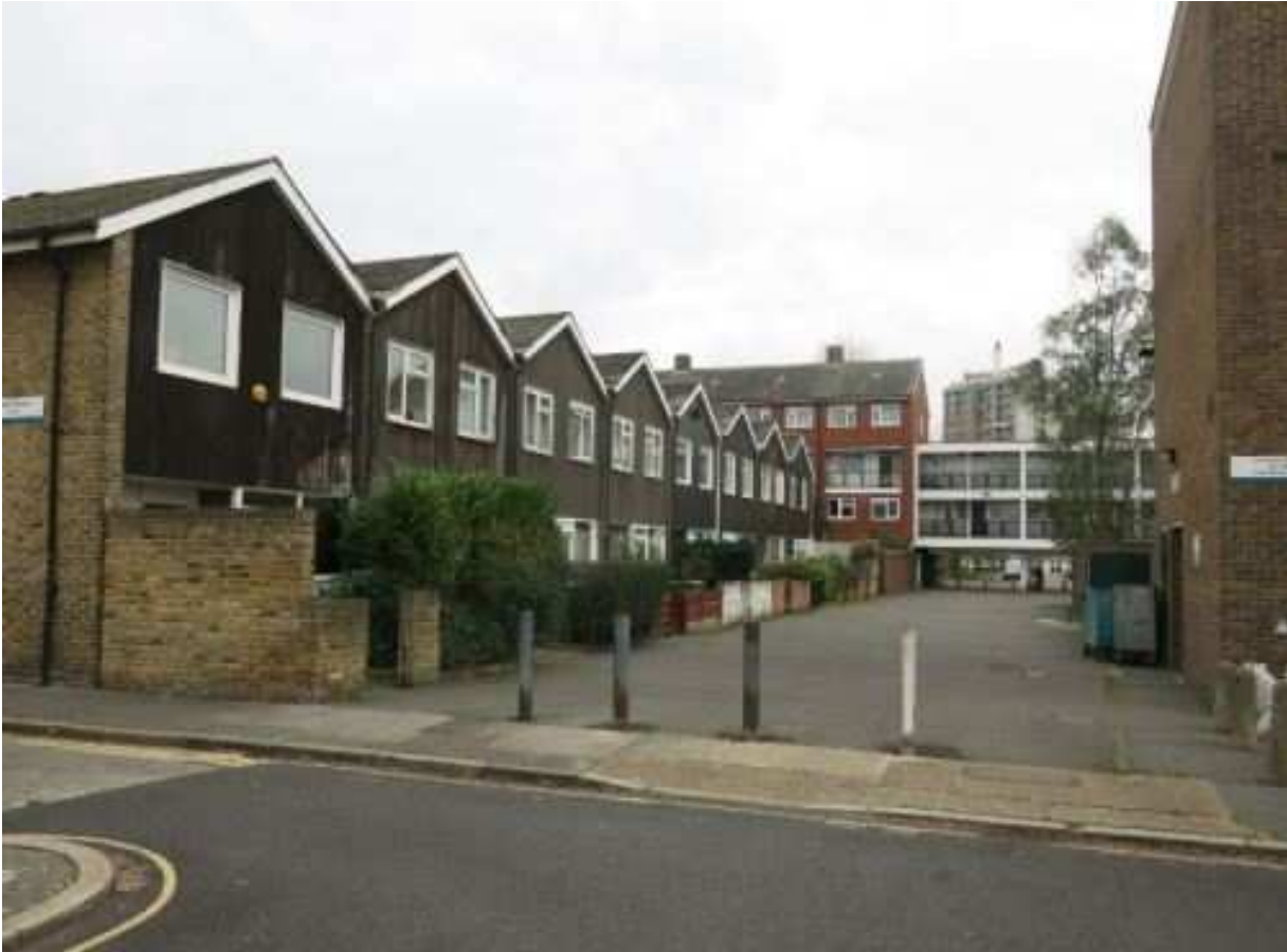
Family houses on Greig Terrace