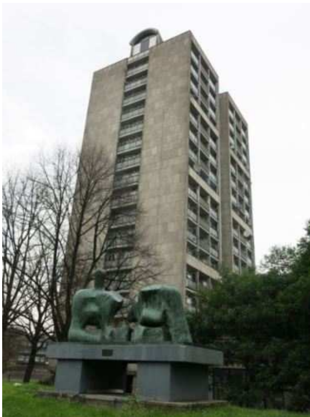
Cornish House with Henry Moore's Two Piece Reclining Figure No. 3 to the foreground

It was seen as well in the artworks and decorative elements which adorned the Estate, notably the work of Anthony Hollaway and Lynn Easthope, employed by the LCC's Housing Committee 'as consultants for decorative treatment on housing estates'. Hollaway's 'hairy mammoth' (marking the discovery of a fossilised mammoth tooth during site excavation) on the exterior wall of the club room survives as does his decorative frieze at the top of Napier Tower but the illuminated sign created for the Estate pub, the Canterbury Arms, and the broken tile mosaic in the precinct commemorating the Chartist meeting in 1848 on Kennington Common and other elements have been lost.