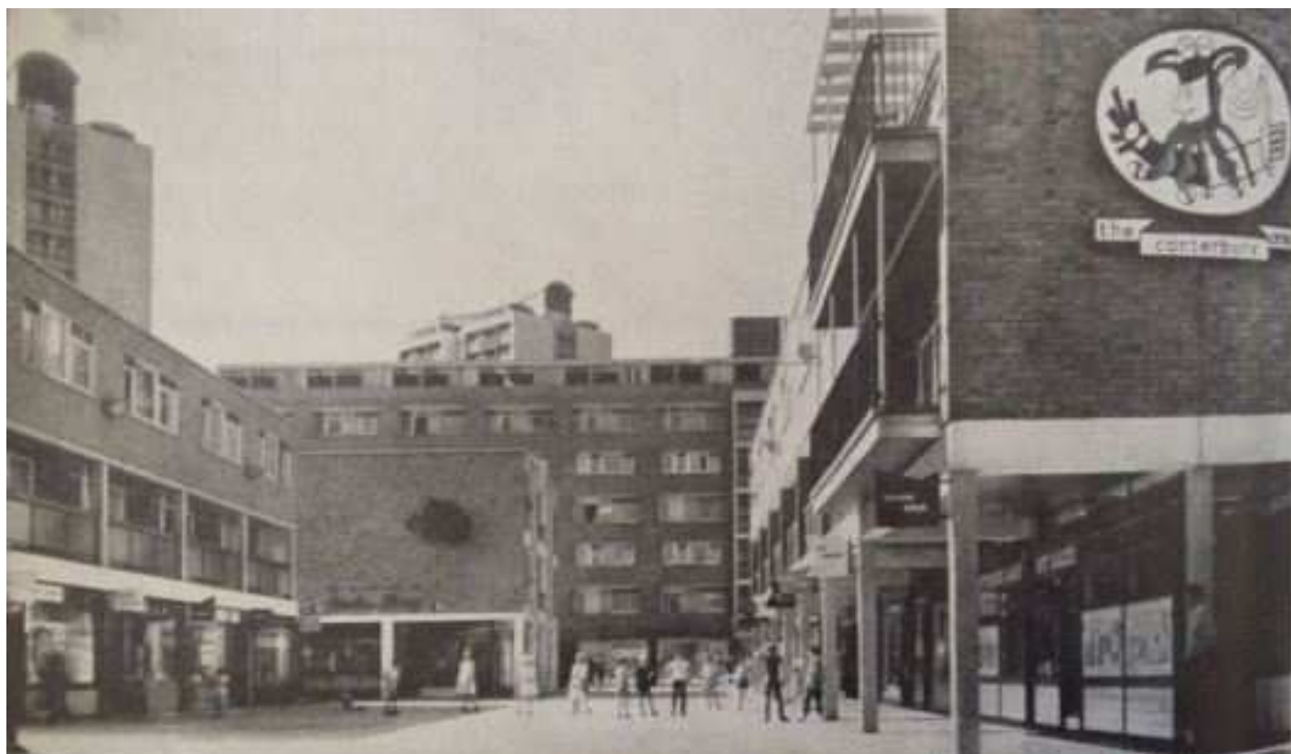
This early photograph of the Precinct also shows Hollaway's 'Hairy Mammoth' and Canterbury Arms pub sign

This attention to a humane environment was seen also in other details of the Estate. It included, for example, a number of small and secluded courtyard spaces – to the apparent consternation of the Housing Manager who foresaw 'immorality in all sheltered corners'.